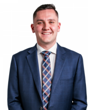
Jackson Walker 4733 6999